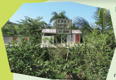
The Institute of Research and Technical Support

For DEVELOPMENT AND PEACE and its partners in the Global South, agro-ecological practices can help small-scale farmers improve their crop yields and thus increase their food security and income. At the same time, these practices allow them to reduce the risk of crop and livestock loss due to climate change. Here are a few examples that illustrate this point.